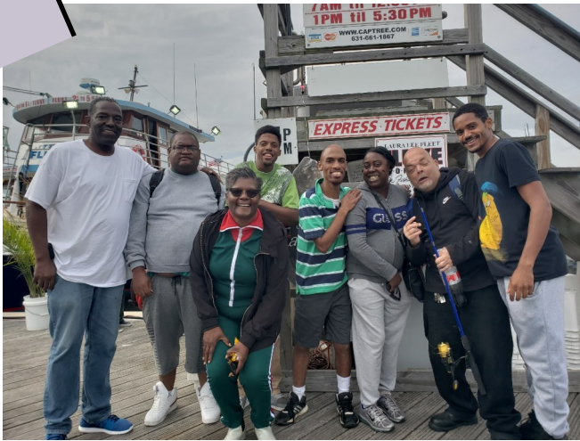
We had a great Residential fishing trip