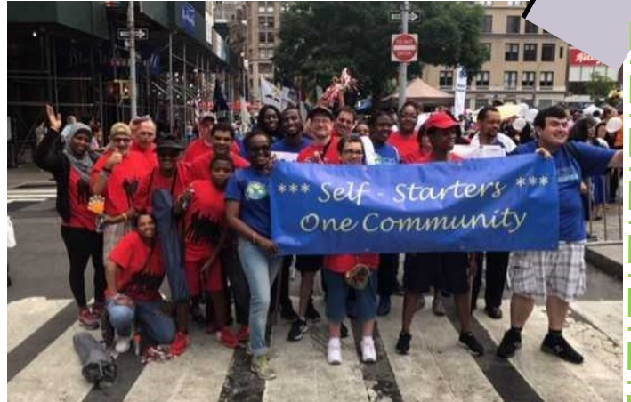
We marched in the NYC Disability Pride Parade