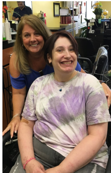
Heather was ecstatic about returning to the hair salon for some pampering