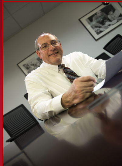
Director of Development