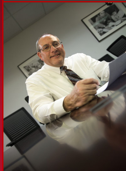
Director of Development